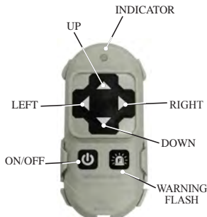
(2) Remote Controls Supplied