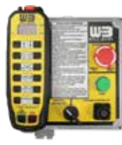
All Night Scan Models