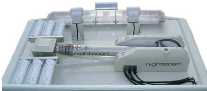
Roof-mounted, fold-down light tower requires no interior vehicle space

The Will-Burt Night Scan® Powerlite is a roof-mounted, fold-down light tower which requires no interior vehicle space. It is typically used on heavy-rescue vehicles, mobile command centers and airport ARFF vehicles. Opposable light fixtures provide equal lighting forward and backward at the same time - 360° of light. Delivering up to 240,000 lumens, the Night Scan® Powerlite is ideal on any vehicle where maximum light is required. The Powerlite 3.0 and 4.5 can be elevated with truck air or optional on-board compressor. The 2.3 comes with a built-in compressor.