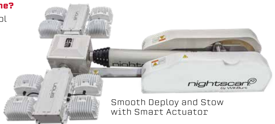
Smooth Deploy and Stow with Smart Actuator

Night Scan IQ delivers ultimate control over your scene lighting. It can be programmed to deploy automatically to a specific direction and angle. Night Scan IQ always knows where it is directed in relation to your apparatus and displays this graphically on the 4.3" LCD screen. Flexibility is built-in with easy to change settings and real-time feedback. Night Scan IQ is Smart Illumination.