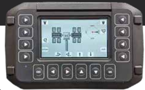
IQ Panel Mount Smart Control System

Choose from handheld tethered models or a panel-mount version. The latest Night Scan IQ Smart Control System identifies the exact light position at any time. Or, select a full-function, wireless / rechargeable remote-control system with 300' range is available for all Night Scan models. The wireless remote can also be paired with an optional tethered remote control for the ultimate in flexibility and peace of mind operation.