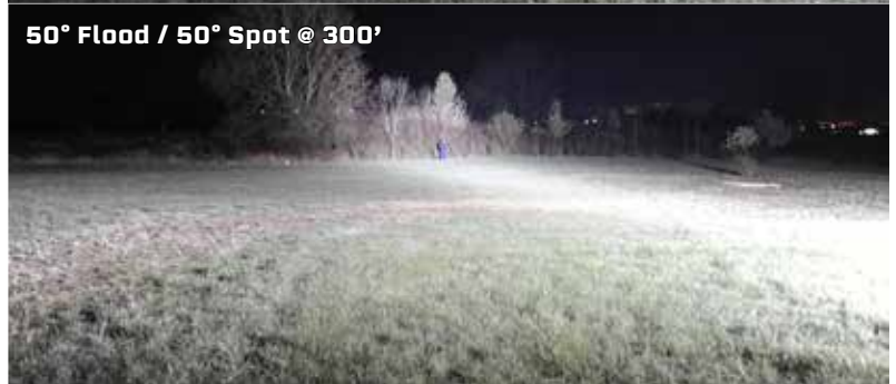
50° Flood / 50° Spot @ 300'