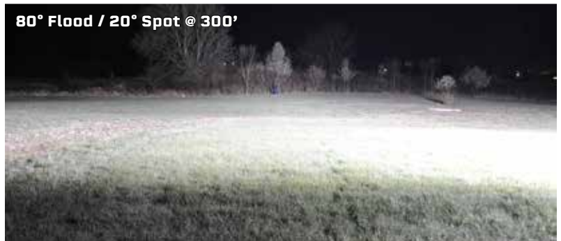
80° Flood / 20° Spot @ 300'