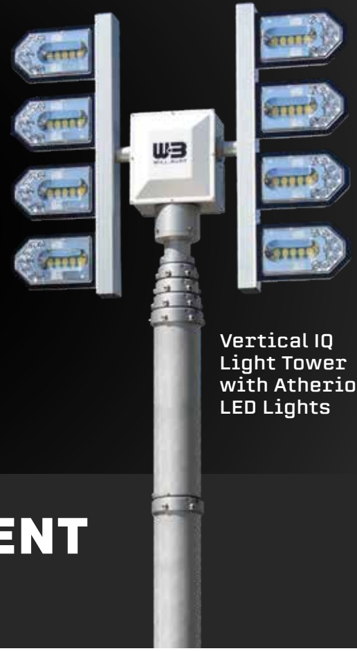
Vertical IQ Light Tower with Atherion LED Lights