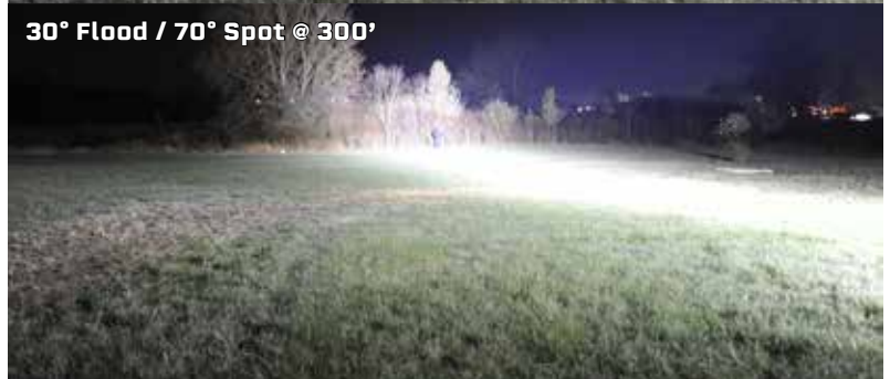
30° Flood / 70° Spot @ 300'