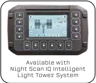
Available with Night Scan IQ Intelligent Light Tower System