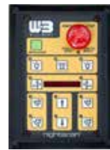
Chief and Vertical Complete