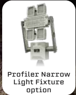
Profiler Narrow Light Fixture option