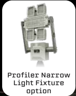
Profiler Narrow Light Fixture option