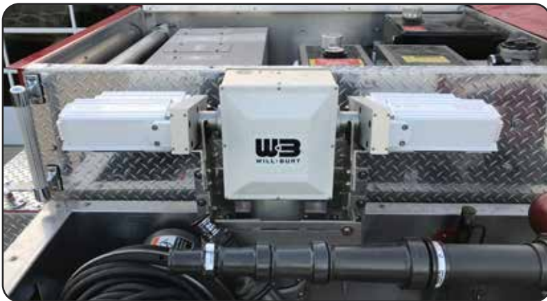
May be installed internally or externally to the side or rear of a vehicle

The Will-Burt Night Scan® Vertical Tower is a vertically mounted light tower which may be installed internally or externally to the side or rear of a vehicle. Used for elevating lights and/or cameras, it is typically used on heavy rescue vehicles, full-size mobile command centers, airport ARFF vehicles and large wreckers. Delivering up to 240,000 lumens with the Atherion IQ light package, the Night Scan® Vertical Light Tower is ideal on any vehicle where maximum light and height are required.