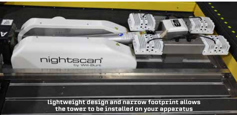
lightweight design and narrow footprint allows the tower to be installed on your apparatus