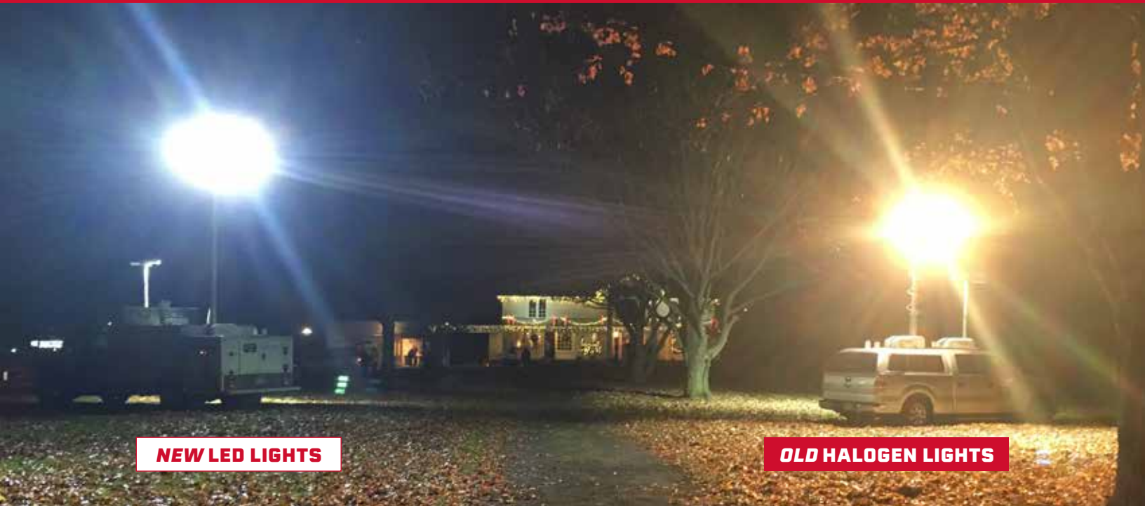
NEW LED LIGHTS