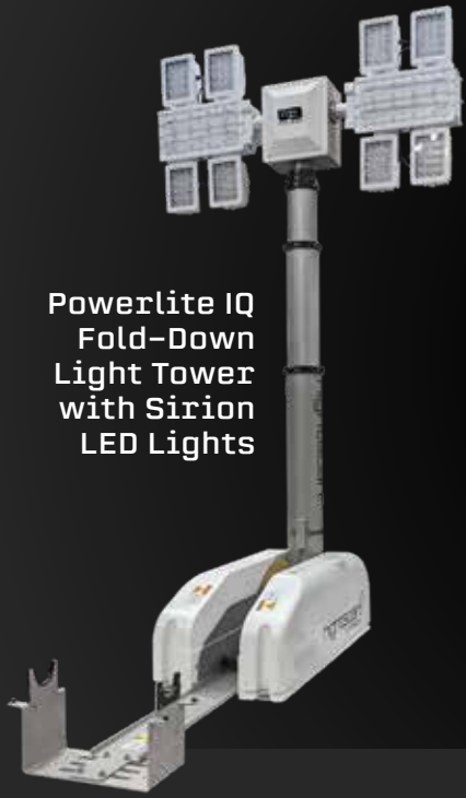
Powerlite IQ Fold-Down Light Tower with Sirion LED Lights