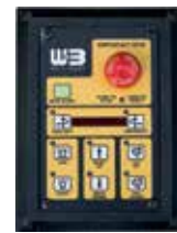
Powerlite, Xtreme and Vertical