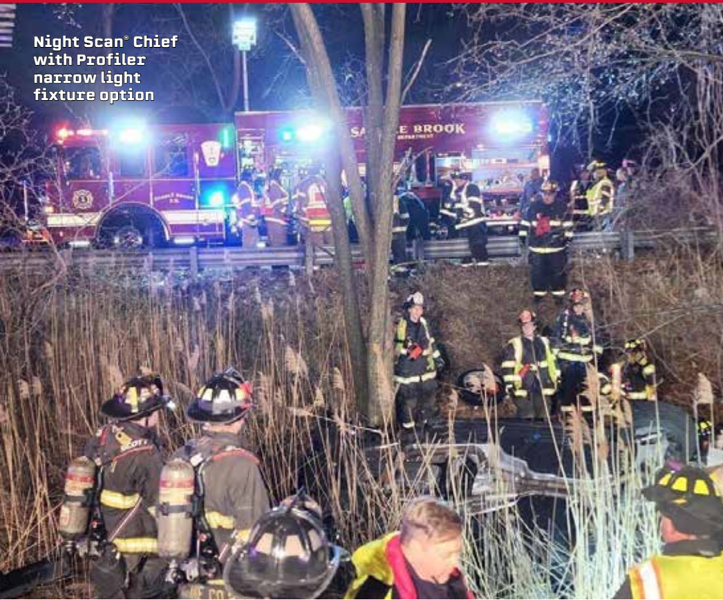
Night Scan® Chief with Profiler narrow light fixture option