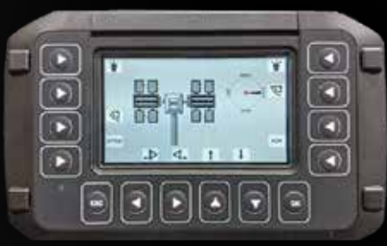
Identify the exact light position at any given time with Smart Control System