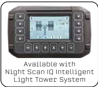
Available with Night Scan IQ Intelligent Light Tower System