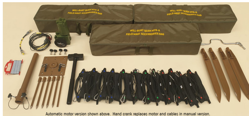
Automatic motor version shown above. Hand crank replaces motor and cables in manual version.